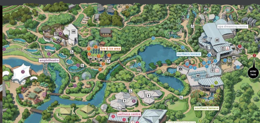
download our map