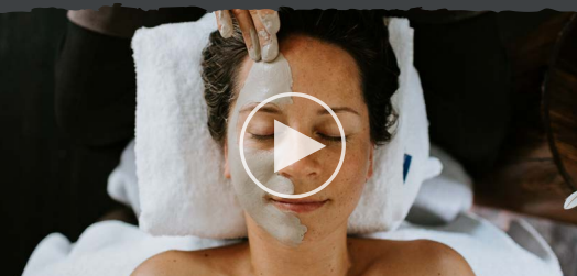
what to expect