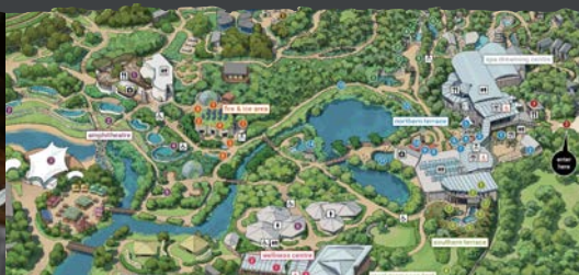
download our map