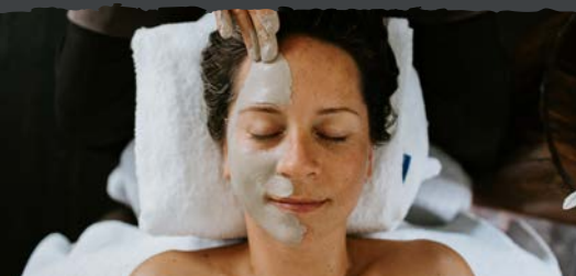
what to expect